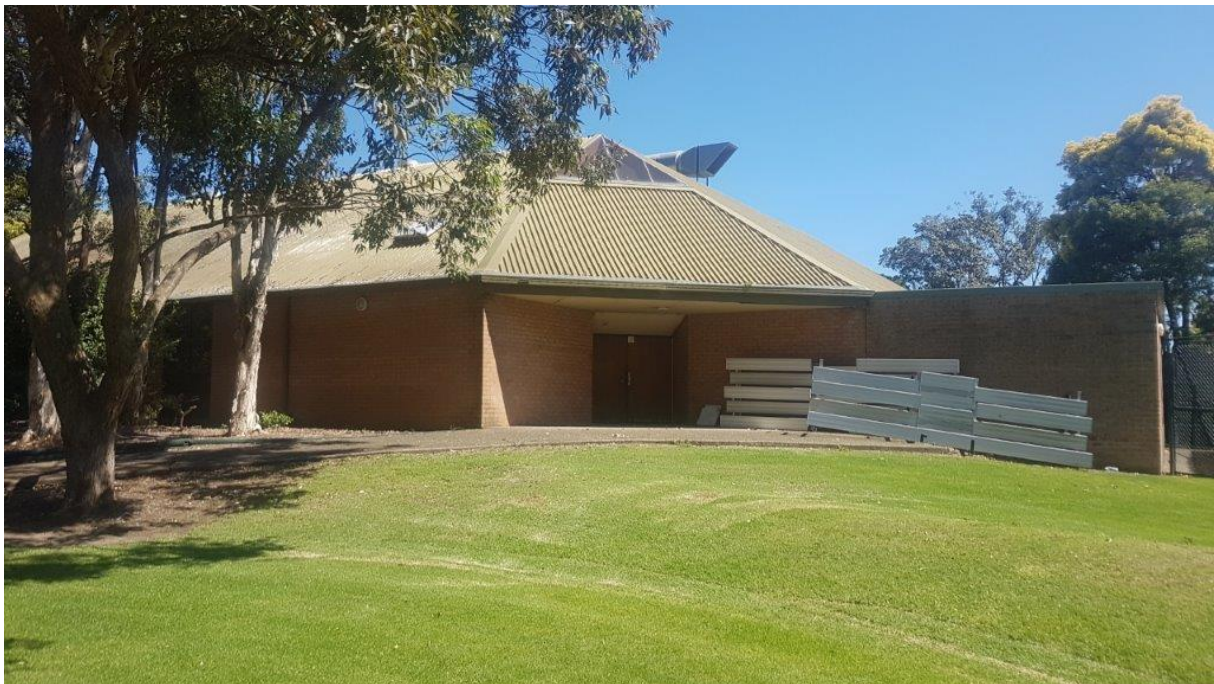
Figure 1 southern façade of the Dean Building (gymnasium)

The Acoustic Impact Assessment which accompanies the REF provides an assessment of the works having regard to the potential acoustic impacts generated by the use of the building post works. The recommendations of the Acoustic Impact Assessment to ensure all windows and doors are closed between 6:00pm and 10:00pm are incorporated into the mitigation measures and conditions of the REF.