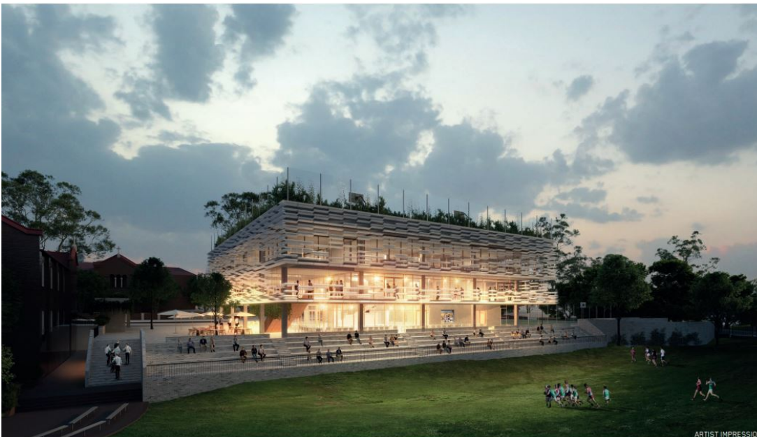
Figure 3 St Patricks College New Science and Learning Building