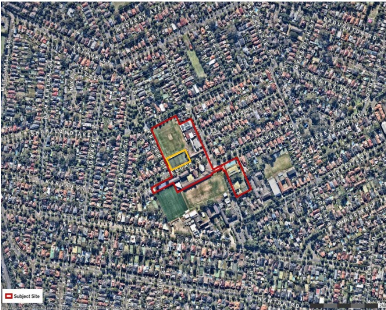
Figure 1 Aerial photograph of the site

The site is located within the Strathfield Local Government Area (LGA, approximately 15km west of the Sydney CBD).